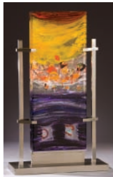
WORLDS Cast glass by Mark Levy 7" w x 17" h x 2" d

RASgalleries, Yountville's prestigious art glass and original fine art gallery, located at 6540 Washington Street, will burst into the summer season with vivid flashes of color and the illusion of motion in new sculptural artistry in glass by Mark Levy and the new works of renowned fine artist, Jean-Pierre de Rothschild. Both artists break barriers; drawing from life experiences and the power of nature's influence to create contemporary masterpieces. "Synergy of Style 2010" opens on Saturday, May 15, 2010 with an artist reception from 5 to 7 p.m. and the show will continue to inspire through the end of June.