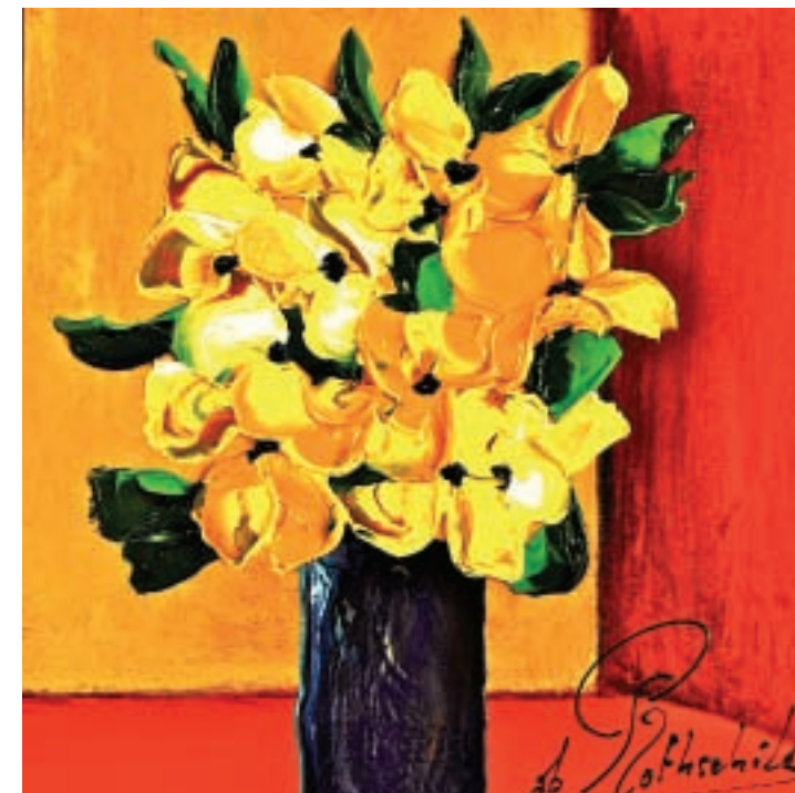
FLEURS JAUMES Oil painting by Jean Pierre de Rothschild 16" w x 16" h

RASgalleries, located at 6540 Washington Street in Yountville, Napa Valley, California, may be reached by calling (707) 944-9211.